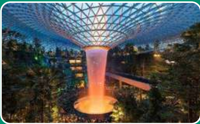
Jewel Changi Airport