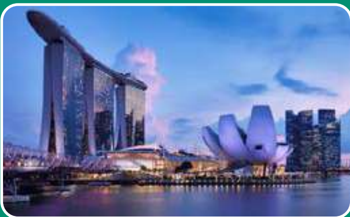
Marina Bay Sands