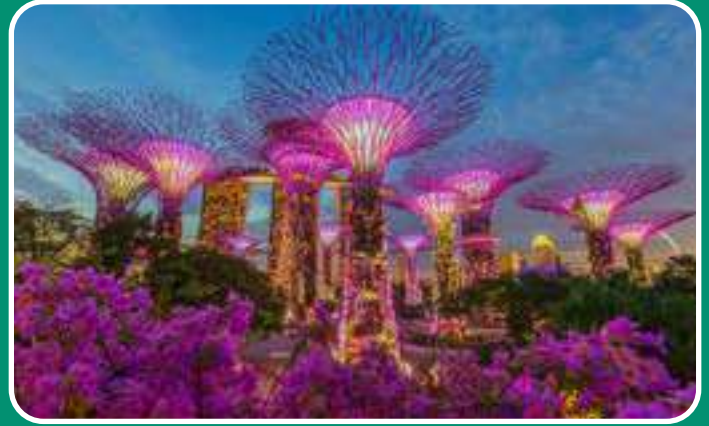
Gardens by the Bay